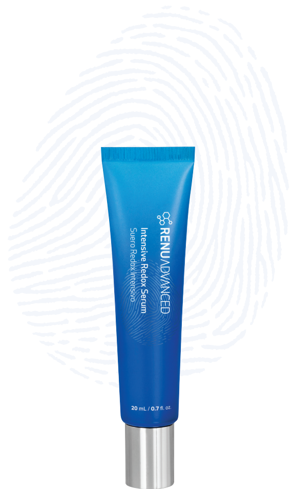
20 mL / 0.7 fl. oz.

ASEA's proprietary process produces life-giving redox signaling molecules. These molecules support communication at the cellular level, improving the healthy, youthful appearance of skin.